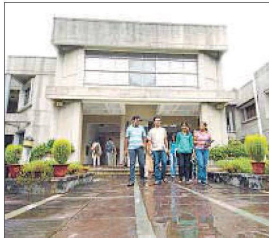
Students at XLRI Jamshedpur